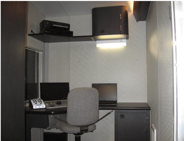
The overhead shelf holds a VHS / DVD recorder and printer.