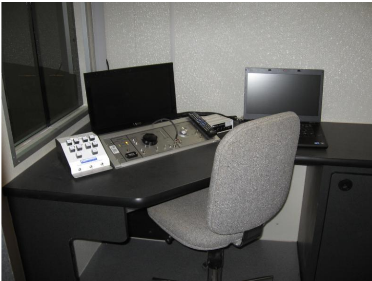
The operator's desk is equipped with a flat screen monitor full camera, camera transport controls and a laptop computer with docking station.