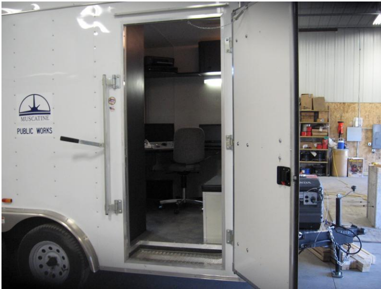
Looking inside the camera operator station.