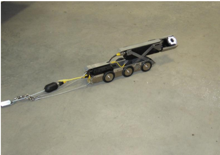
The camera is equipped with a zoom lens and has full pan and tilt capabilities.