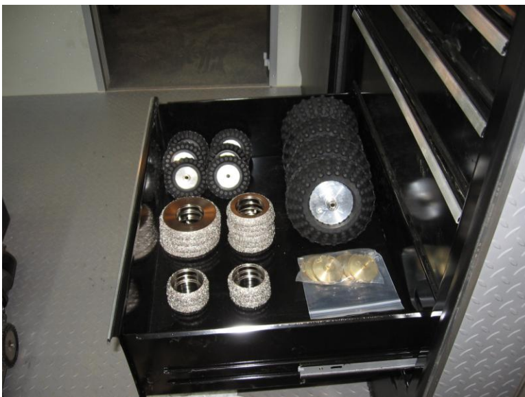
Camera transport accessories include an assortment of wheels for various pipe conditions.