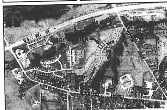
SITE VICINITY MAP

(000.0) RECORDED DISTANCE --- BOUNDARY OF SURVEY --- UTILITY EASEMENT LINES --- LOT LINES --- RIGHT-OF-WAY LINE