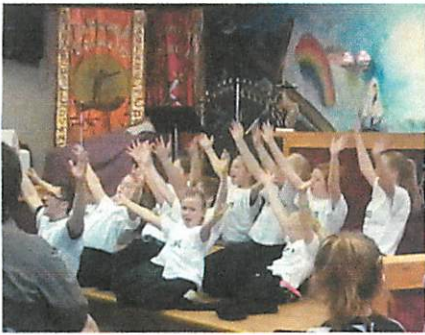
COURAGOUS 4 CHRIST DRAMA & OUTREACH MINISTRY