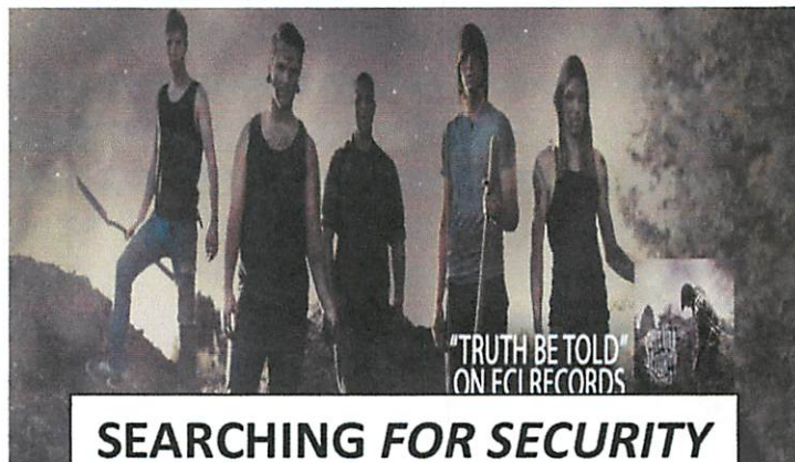
SEARCHING FOR SECURITY