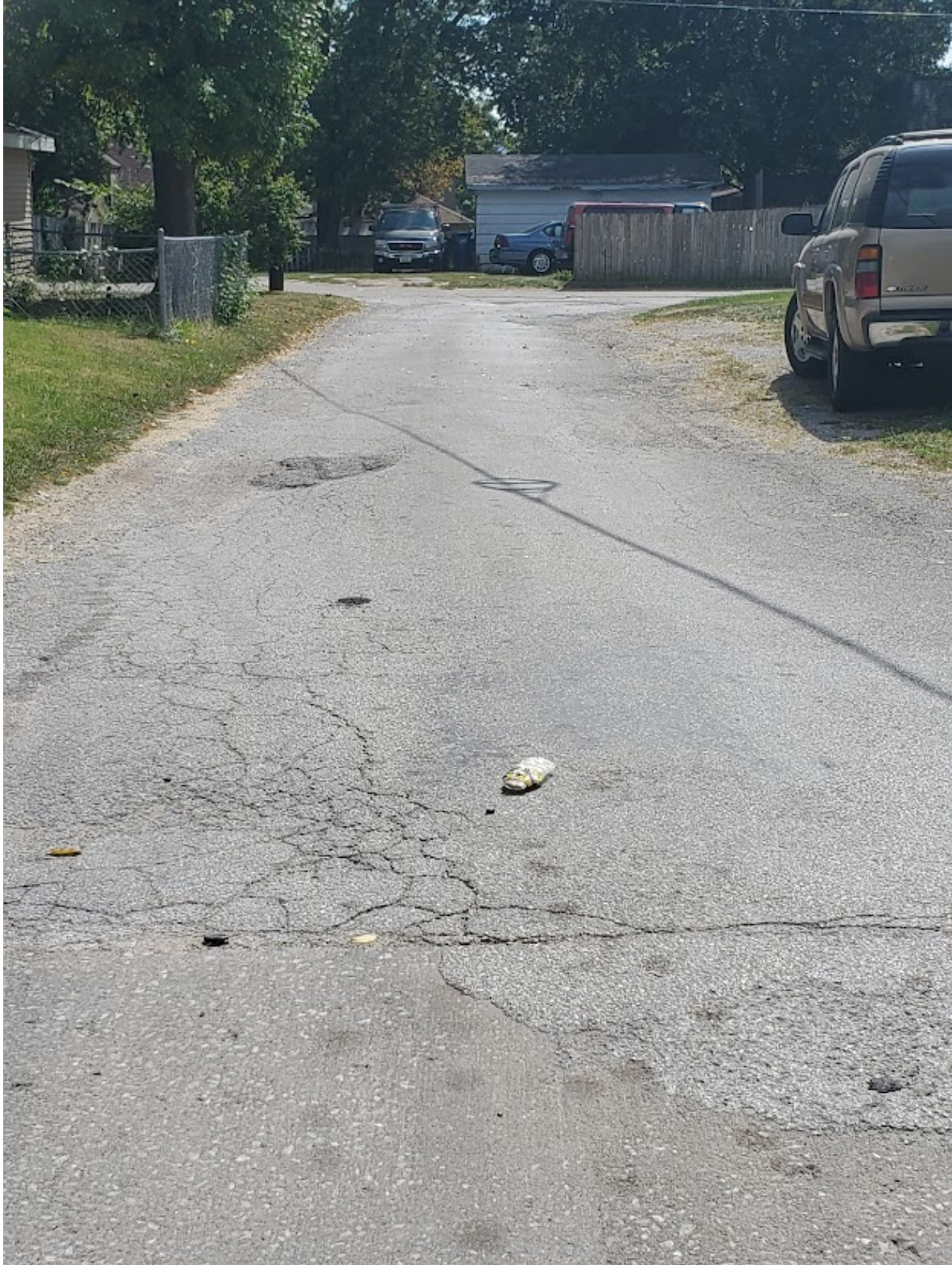
3 rd alley at E 5 th St – this alley to remain open