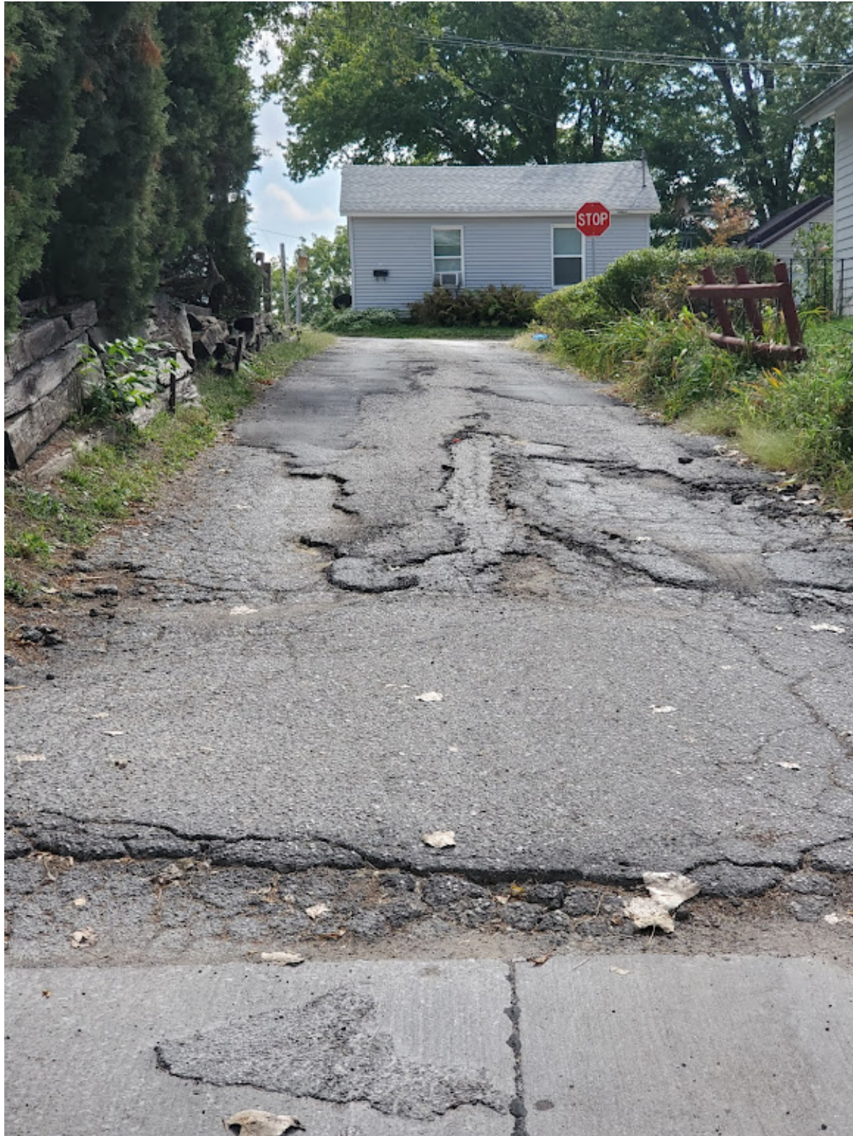
1 st alley at E 5 th St – this is the alley to be vacated