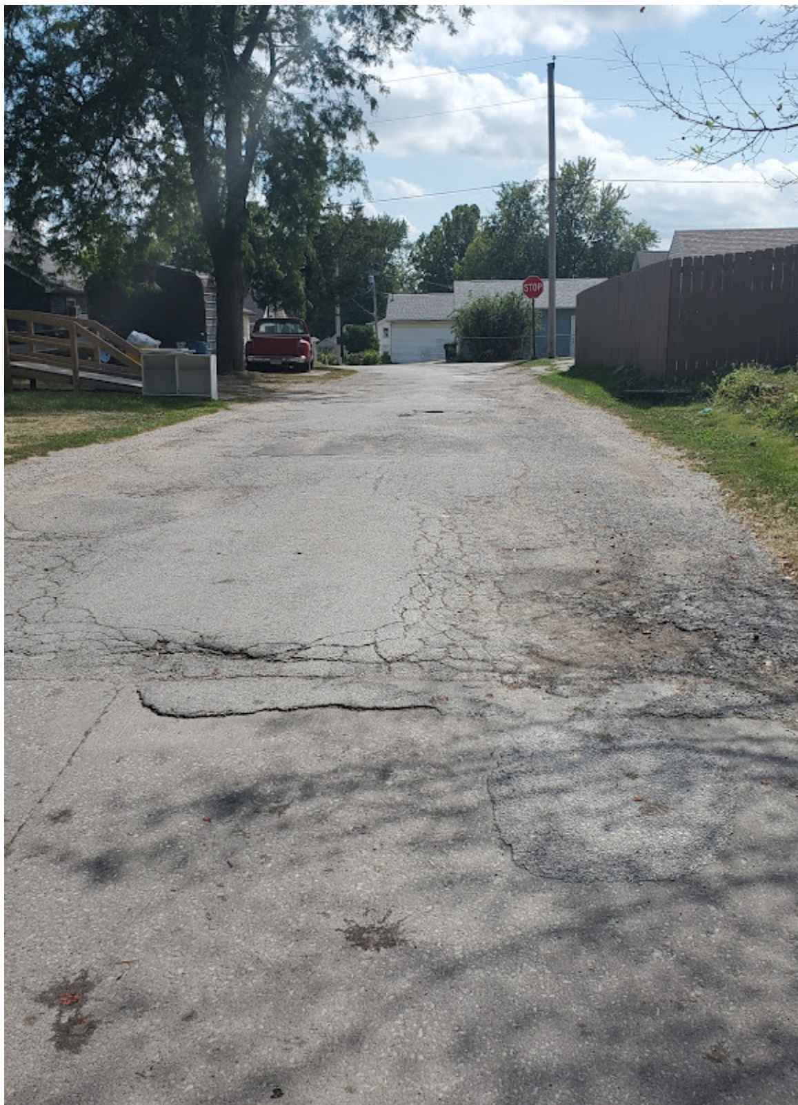
2 nd alley at E 5 th St – this alley to remain open