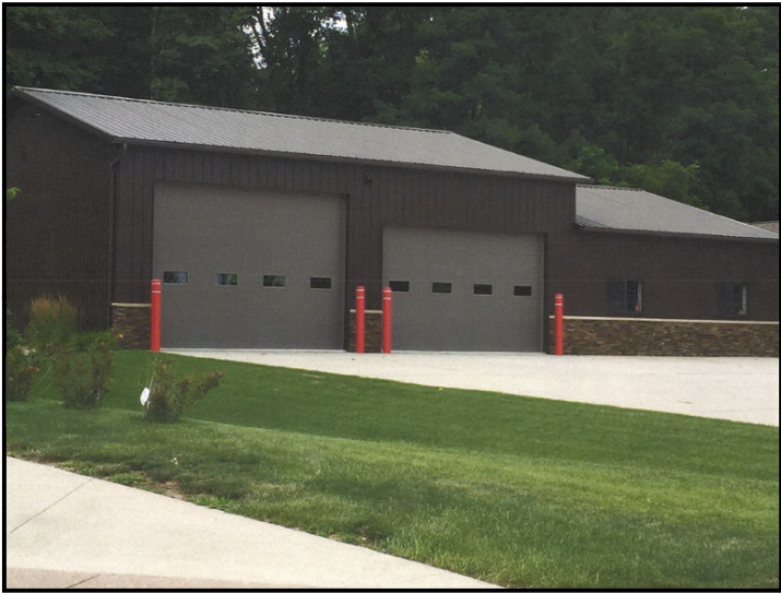
Image, provided by the applicant, of the type of accessory building proposed