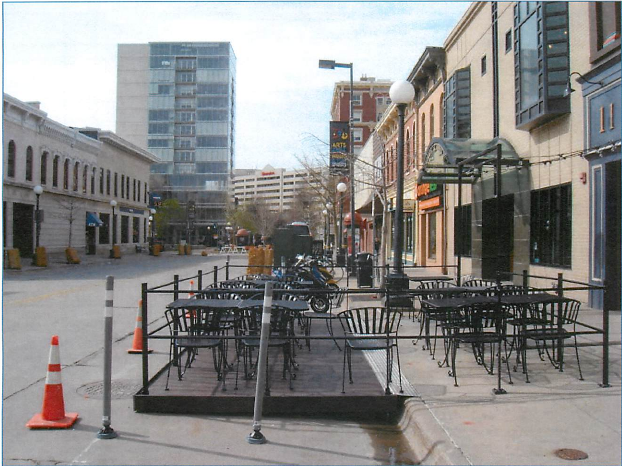
On Street Dining in Iowa City

The intention of the pilot program is to provide maximum regulatory flexibility, and then develop permanent regulations based on the experiences of the pilot program. However, the following regulations are being proposed to ensure the outdoor dining activities on public right-of-way during the pilot program does not endanger public safety.